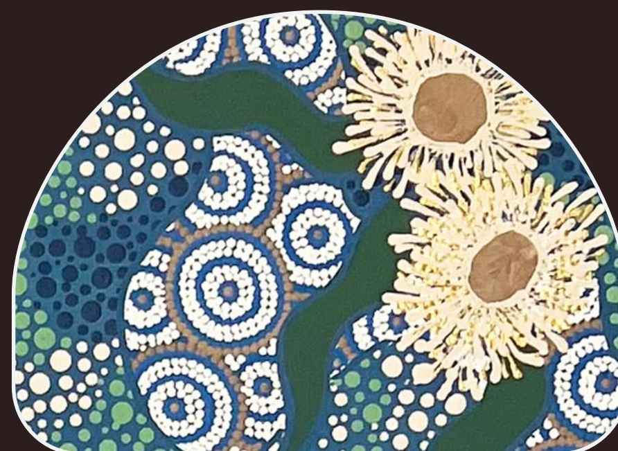
Powers of nature