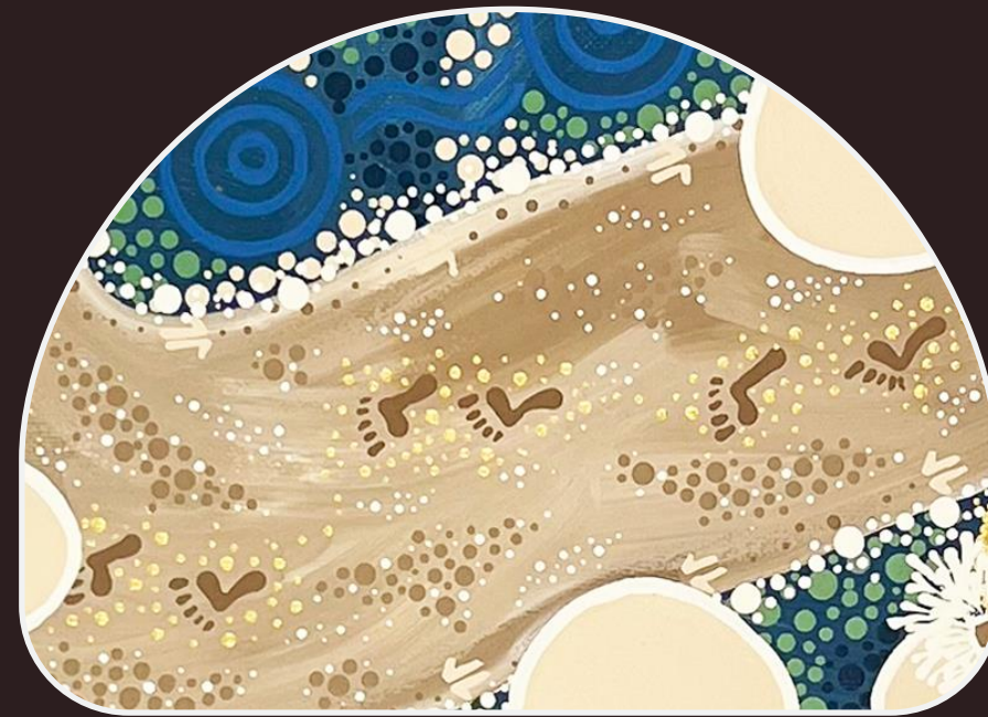
Walking our life path