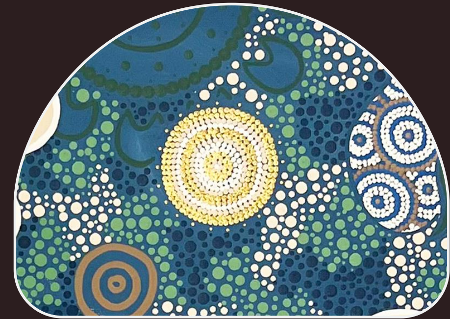
Ancestral protection and guidance